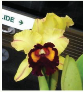
2. Cattleyas – Over 100mm 1 st . Rlc. Toshie Aoki 'Blumen Insell' Zimmerman J & M