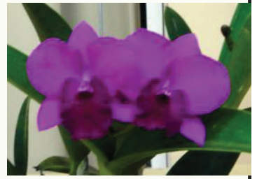
4. Cattleya Under 60mm 1 st . Gct. Swig of Brandy Roulstone N & T