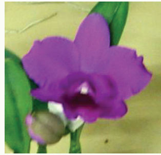
3. Cattleyas – 60mm to 100mm 1 st . C. Elusive Dream 'Pearl' Maggs G