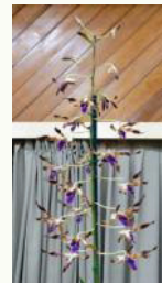
13. AUSTRALIAN NATIVE HYBRID DENDROBIUM: 1 st . Den. Magenta's Blood Shot x canaliculatum McKenzie J & I