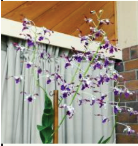
1. Dendrobium 1 st . Den. Unknown Cleal D