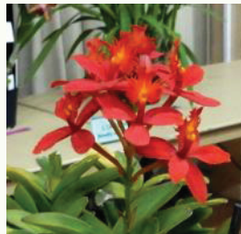
12. MISCELLANEOUS SMALL Under 50mm: 1 st . Epi. Unknown Coppus M