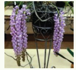
17. Species – Exotic Monopodial 1 st . Rhy. retusa Roulstone N & T