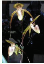
6. Paphiopedilum 1 st . Paph. Johanna Burkhardt Tierney M