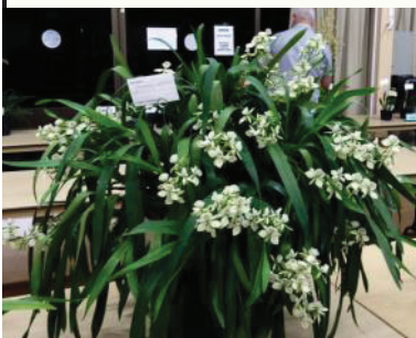
18. Intermediate – Cattleya Alliance 1 st . Psh. fragrans x radiata Filia A & K