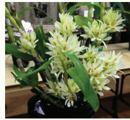
16. Species – Exotic Sympodial 1 st . Den. bracteosum Haase K