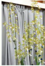
5. Cattleyas – Novelty or Cluster 1 st . E. Mary Motes x Bees Knees Haase K