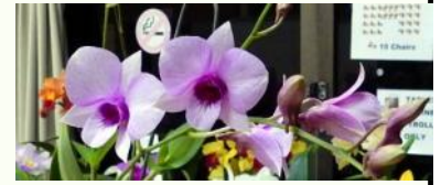
15. Australian Native Species 1 st . Den. bigibbum var. superbum Roulstone N & T