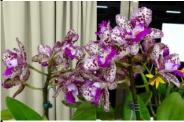
5. Cattleyas – Novelty or Cluster 1 st . C. Lulu 'Hot Pink' x Caudebec Baxter L