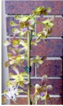
1. Dendrobium 1 st . Den. Heart of Gold Baxter L