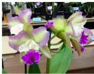
21. Novice Cattleya Alliance 1 st . C. Caudebec x Rlc. Roy Maidment Hatzirodos J