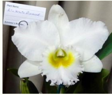
2. Cattleyas – Over 100mm 1 st . Rlc. White Diamond Haase K