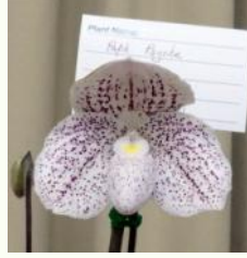
6. Paphiopedilum 1 st . Paph. Psyche Tierney M