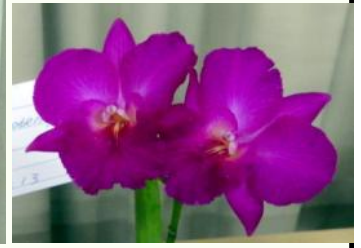
4. Cattleya Under 60mm 1 st . Ctna. Topaz Raspberry 'Lea' Maggs G