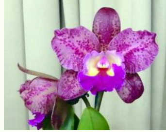
3. Cattleyas – 60mm to 100mm 1 st . Rby. Hawaiian Leopard Maggs G