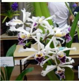
16. Species – Exotic Sympodial 1 st . C. crispa Haase K