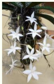
17. Species – Exotic Monopodial 1 st . Aergs. biloba Tierney M