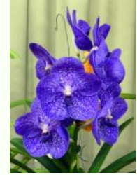
8. Vandaceous Alliance Flowers over 40mm: 1 st . V. Pakchong Blue 'Giant Blue' Mogg D