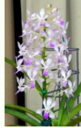
7. Vandaceous Alliance Flowers up to 40mm 1 st . Van. Fuchs Ocean Spray Haase K