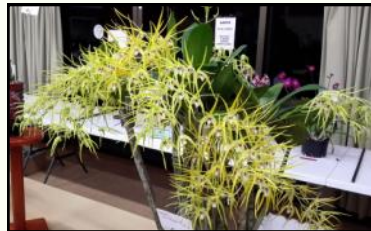
13. Australian Native Hybrid Dendrobium: 1 st . Den. Hilda Poxon Kapernick G