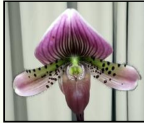
6. Paphiopedilum 1 st . Paph. Shadowlands x Night Hawk Tierney M