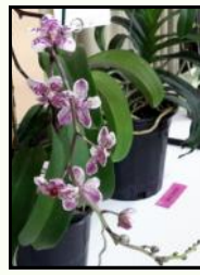
7. Vandaceous Alliance Flowers up to 40mm: 1 st . Srts. Bravehart 'Sandy' Tierney M