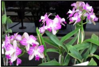
5. Cattleyas – Novelty or Cluster 1 st . C. Monte Elegante x Jungle Hotspot Maggs G