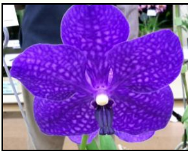
20. Intermediate Any Other Genus: 1 st . V. Roongpruk Blue 'Chao Praya' Kehoe A