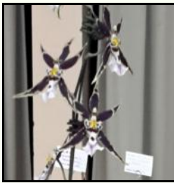
10. Oncidiinae 1 st . Brsdm. Golden Gamine 'White Night' Haase K