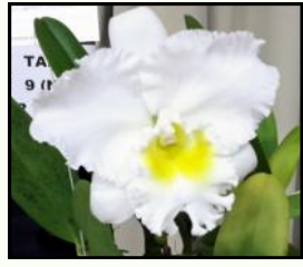
2. Cattleyas – Over 100mm 1 st . Rlc. Memoria Gordon Vallance Maggs G