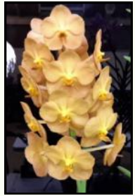
8. Vandaceous Alliance Flowers over 40mm: 1 st . V. Thai Classic Mogg D