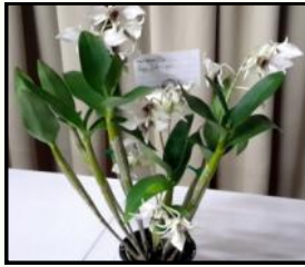
1. Dendrobium 1 st . Den. Roy Tokunaga Rutherford J