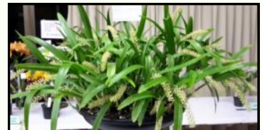
15. Australian Native Species: 1 st . Lip. condylobulbon Haase K