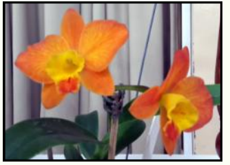
4. Cattleyas Under 60mm: 1 st . C. Spice Angel Martin C